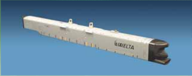
EL/L-8222 - Pod for large aircraft