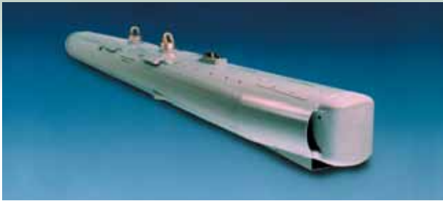
EL/L-8212 - Pod for small aircraft