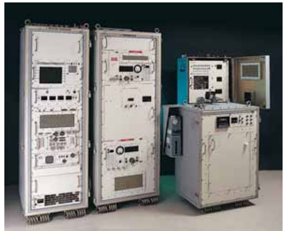
Radar System Units Below Deck