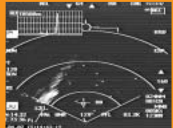
Sea Search and RS Display