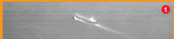
Target Optical image