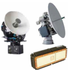
SATCOM WB & NB AAU