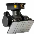
Directional LOS AAU