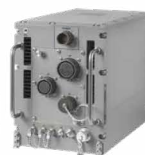
NC2 Hub/Terminal TRU