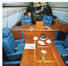
VIP AND COMMAND POST