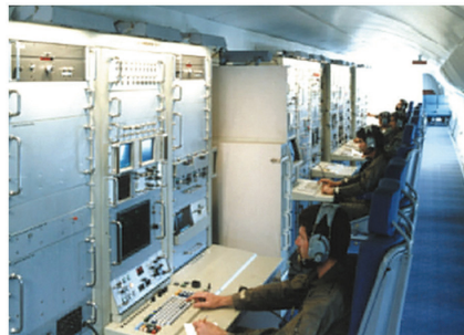
"SMART TANKER" - MMTT + C4I, ISR, COMMUNICATION NETWORK