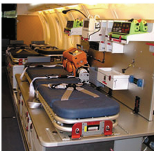
MEDICAL EVACUATION (MEDEVAC)