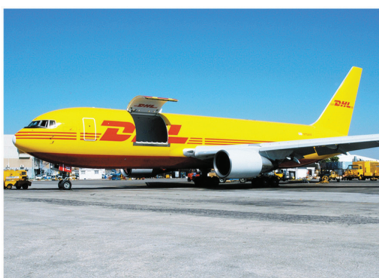
OPTIMAL CARGO CONFIGURATION