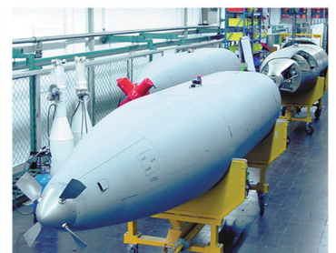
HOSE & DROGUE REFUELING POD