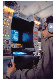
BOOM OPERATOR STATION