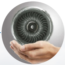
Lease, Trade and Exchange